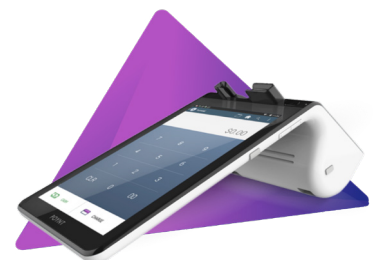
POYNT TERMINAL World's first smart terminal