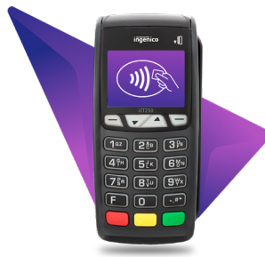
INGENICO ICT250 Colour desktop