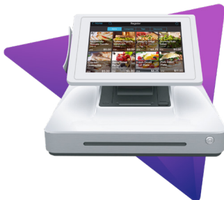
TALECH POS Restaurant & Retail solution