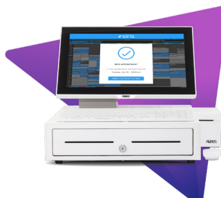
SIRIS POS Scheduling + product solution